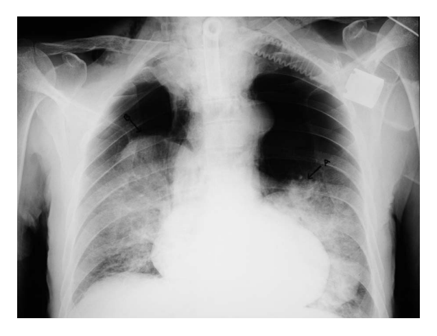
Figure 2 Bilateral pneumothoraces with lung collapse and pulmonary oedema.

CXR revealed bilateral pneumothoraces, subcutaneous emphysema and bilateral pulmonary infiltrates consistent with pulmonary oedema (figure 2). A left chest drain was inserted with immediate improvement in respiratory effort and oxygen saturation (>90%). Treatment with oxygen, diuretics, bronchodilators and chest physiotherapy resulted in gradual resolution of both pneumothoraces. This was confirmed by CXR (figure 3). The chest drain was removed on day 2 and the patient was discharged on day 10.