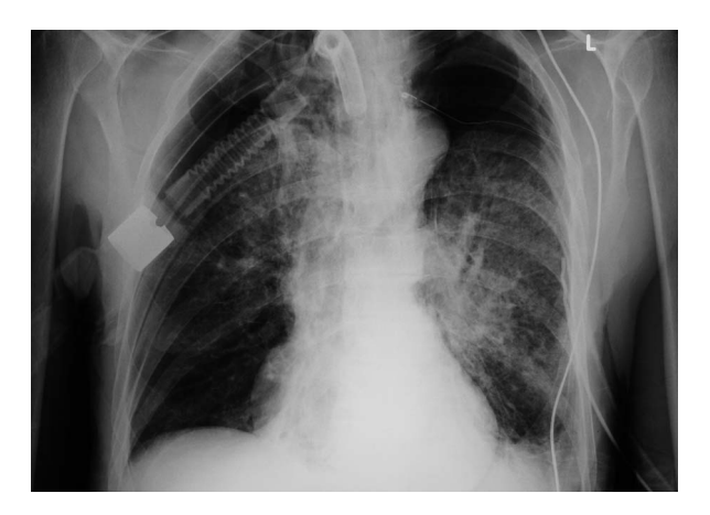
Figure 3 Chest x-ray following left chest drain insertion showing partial re-expansion of the lung on that side. The right-sided pnemothorax was resolved. Bilateral pulmonary oedema is evident.

Tracheostomy is one of the oldest surgical procedures dating back to 3000 years. A Greek physician, Asklepiades is credited with undertaking a tracheostomy in 100 BC.<sup>3</sup> Today, the complication rate ranges between 4% and 40% depending on the study design,<sup>1 2 4</sup> and may relate to the procedure itself or to the equipment used. The commonest early complication is haemorrhage (3–6% of cases); others include tube displacement or obstruction, infection, pneumomediastinum and pneumothorax.<sup>1 2 4 5</sup>